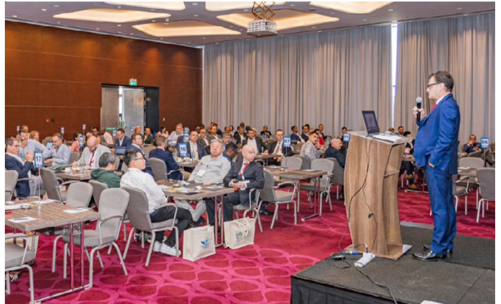
ALN and ALNA meeting - Nairobi, 2023